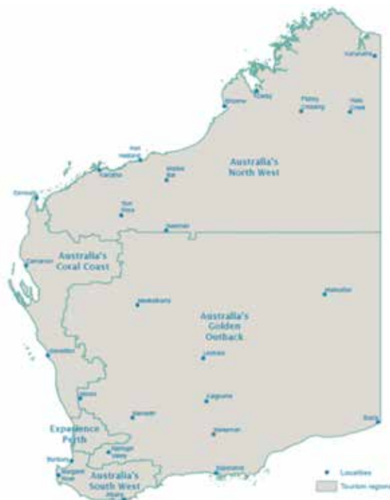
Table 3: Western Australian tourism campaign regions

We used the campaign regions because they provide a reasonable level of geographic coverage that matches data availability. Data availability and quality deteriorate with datasets that aggregate tourism activity at smaller geographic scales.